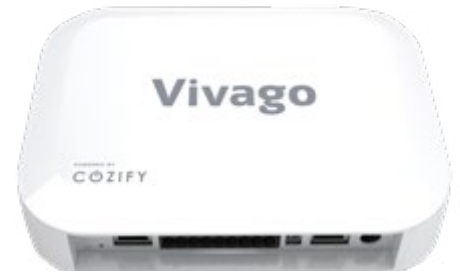
Vivago Room POINT