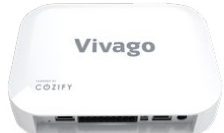
Vivago Go POINT

Available in six hardware configurations for flexible installation